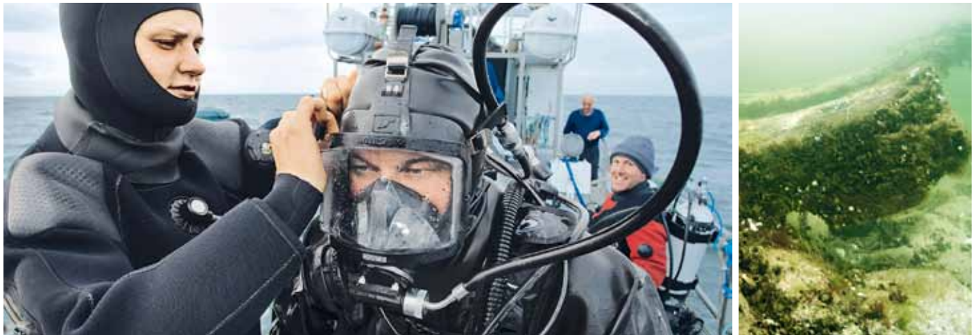
Specialist divers prepare themselves for the underwater salvage operation.

NEWSLETTER ABOUT THE NATURAL GAS PIPELINE ACROSS THE BALTIC SEA ISSUE 11 / AUGUST 2009