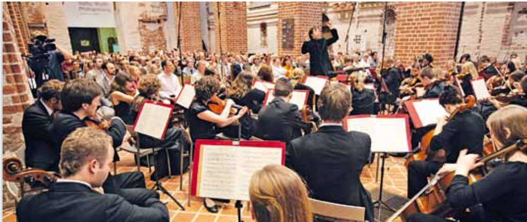
Baltic Youth Philharmonic: Talented musicians create a common tradition for the Baltic region.

Interview with Kristjan Järvi, Founding Conductor & Music Director