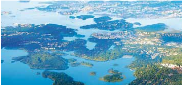
The transboundary impacts on Finland are described in the Espoo Report.