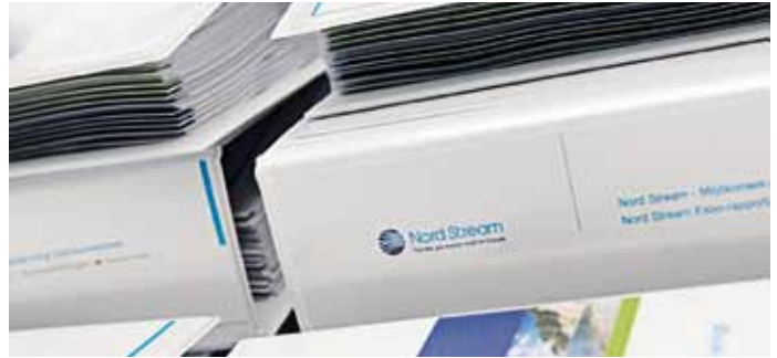
The Espoo Report contains exhaustive analysis of the Baltic Sea ecosystem.